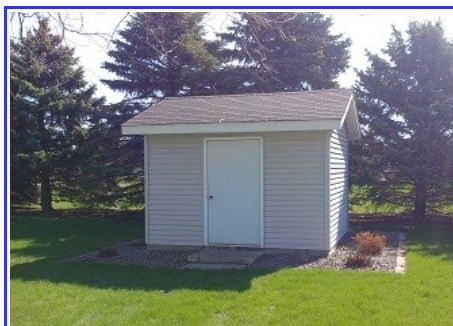
10' x 12' backyard shed