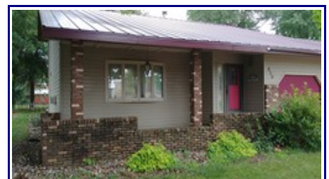
Front Patio Area

Listing Price: $82,200 MLS #: 6028068 Finished Footage Above Grade: 1,432 Legal Description: See Parcel # 240292900 Taxes with Assessments: $1692.00 Assessments: $36 (incl) Lot Size: 75 x 150 Siding: Steel, Brick Roof: Steel, (Approximately 15yrs) Condition: Good Basement: Full, Unfinished Garage: 2-Car Attached Garage Air Conditioning: Central Heating/Cooling: Fuel Oil Forced Air Fireplace: Gas, in Living Room Laundry Area: Main Floor off of Kitchen Electrical: Breakers