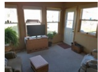
4 Season Porch