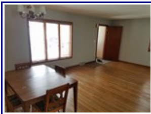
Living Room/ Dining