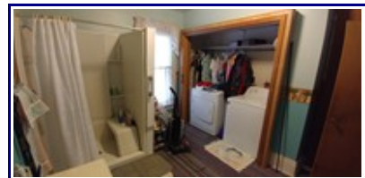
Main Floor Laundry

Listing Price: $35,500 MLS #: 6028145 Fin Footage-Above Grade: 1,298 Square Feet RE Taxes With Assessment: $362.00 Construction: Stick Built Exterior: Vinyl Roof: Asphalt Basement: Full, Unfinished Garage: Detached 2 Car Heating: Natural Gas, Forced Air Cooling: Portable Unit Bathrooms: 3/4 Main Floor, Full Upper Level Electric Service: Breakers Water: City Sewer: City