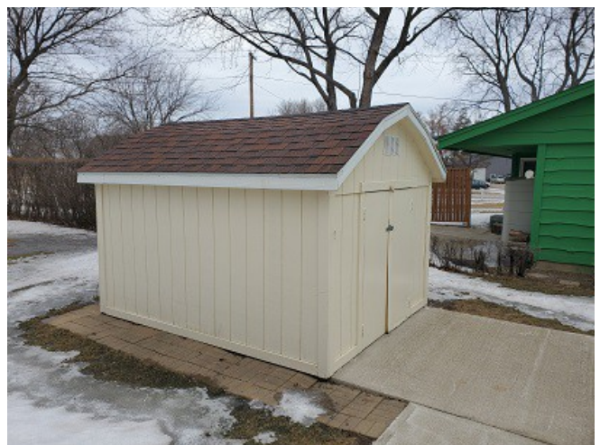
8' x 10' shed