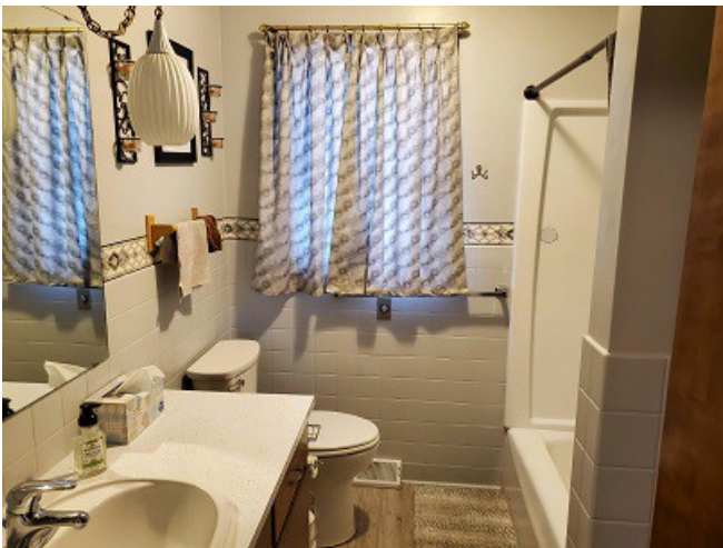
Renovated main floor full bathroom