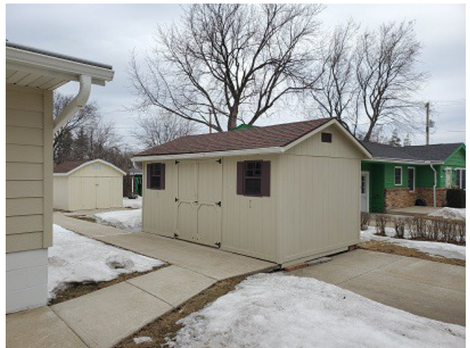
10' x 16' shed