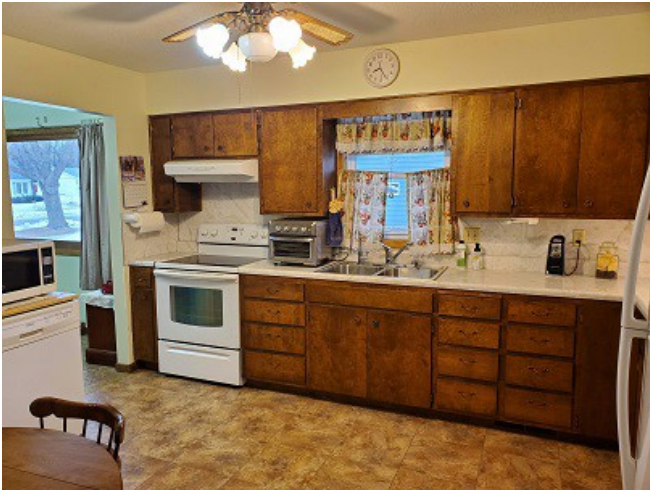
View of kitchen as you enter the house from the garage